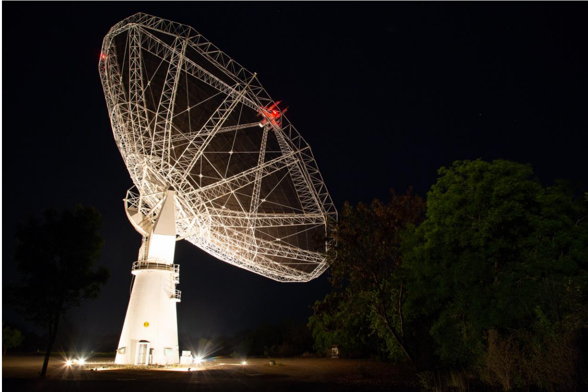
A GMRT Antenna at night.