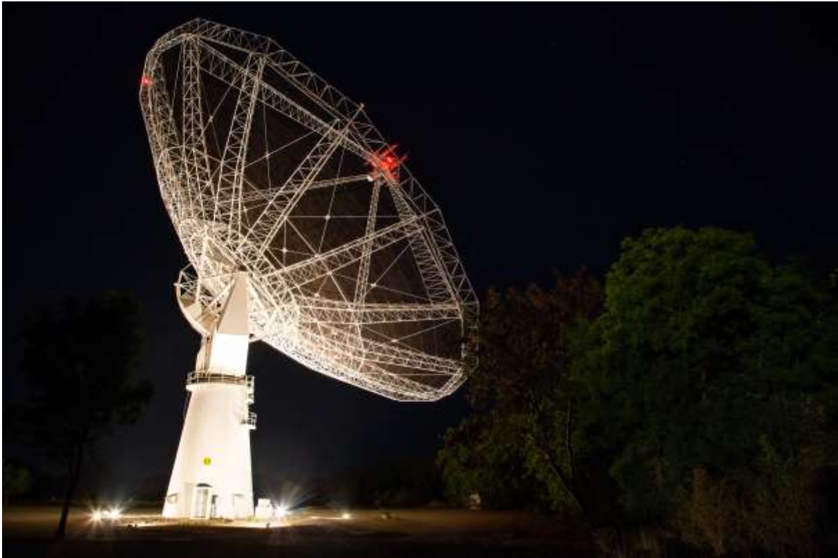
Caption: A GMRT antenna at night.